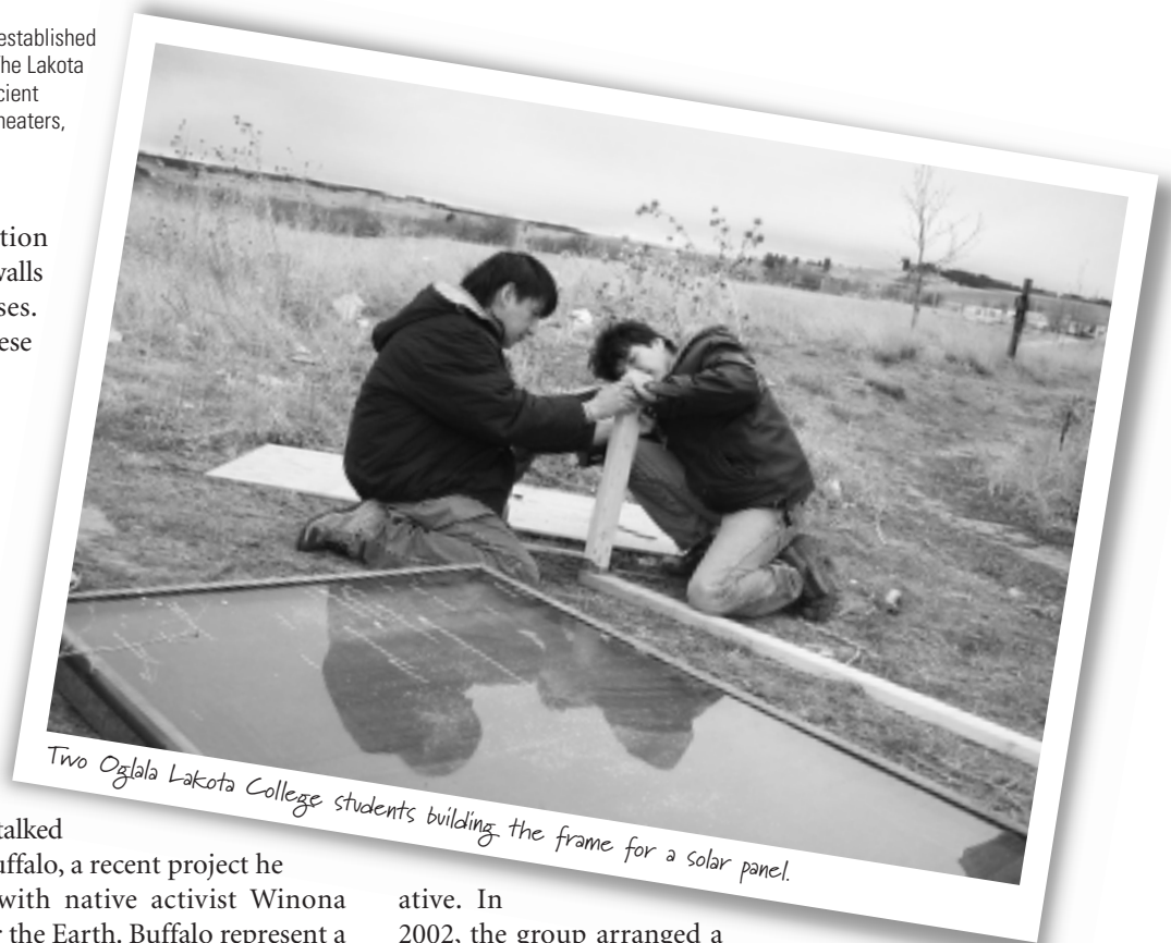
Two Oglala Lakota College students building the frame for a solar panel.

TWP's mission on the reservation is unique and provoc-