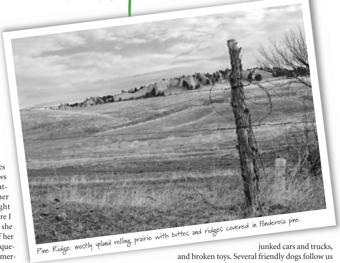
Pine Ridge: mostly upland rolling prairie with buttes and ridges covered in Ponderosa pine.

We’ve come to Cleo’s at her invitation, to decide where to place a solar heating system. Tomorrow and the next day we will come back with a crew, tools, and materials. But as we tour her surroundings, we can’t help but notice more. Clothes are piled high in all the rooms; a few flat spots are swiped clean for sitting or sleeping. Windows are broken and covered with plastic, as are holes in the walls. The water isn’t working. Outside, the trailer is surrounded by detritus—household trash,