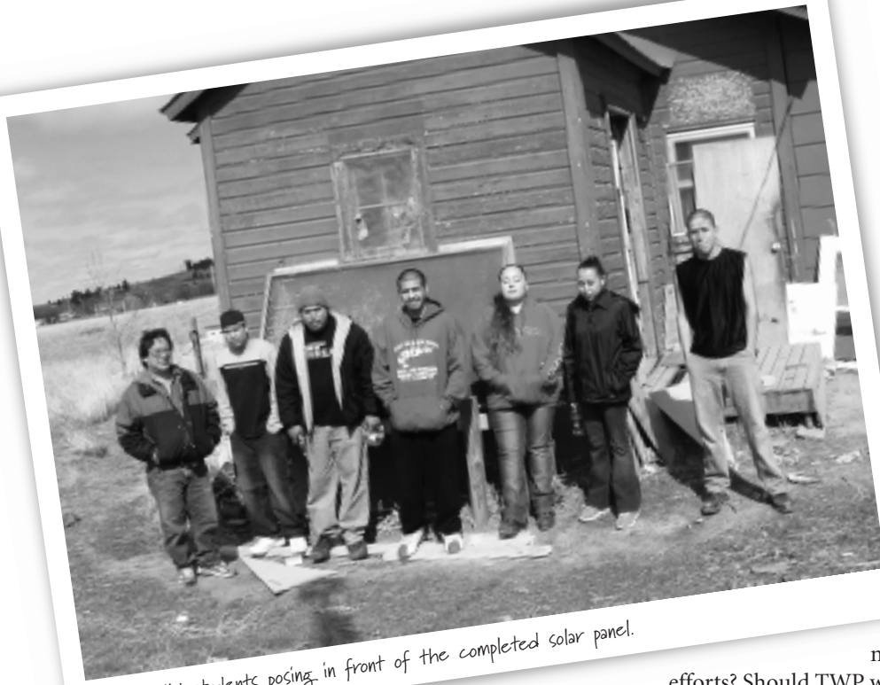
Youth Build students posing in front of the completed solar panel.

religious groups have come, gone, and stayed by the dozens. Many individuals—some former reservation residents, some not—have made the fight against Pine Ridge’s poverty and housing problems a major life commitment.